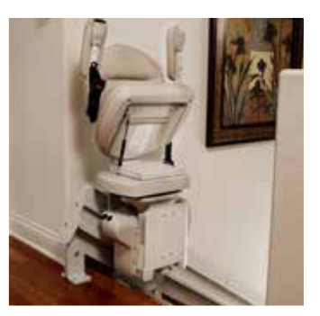
Power folding footrest flips up/down when seat is raised/lowered.