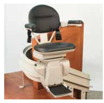
Mid-park and charge station for staircases with middle landings.