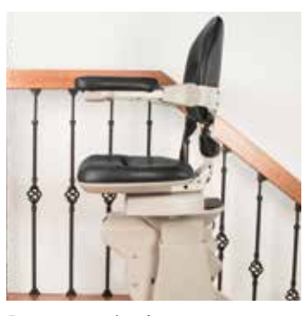
Power swivel seat. Control on chair armrest or wireless call/send.