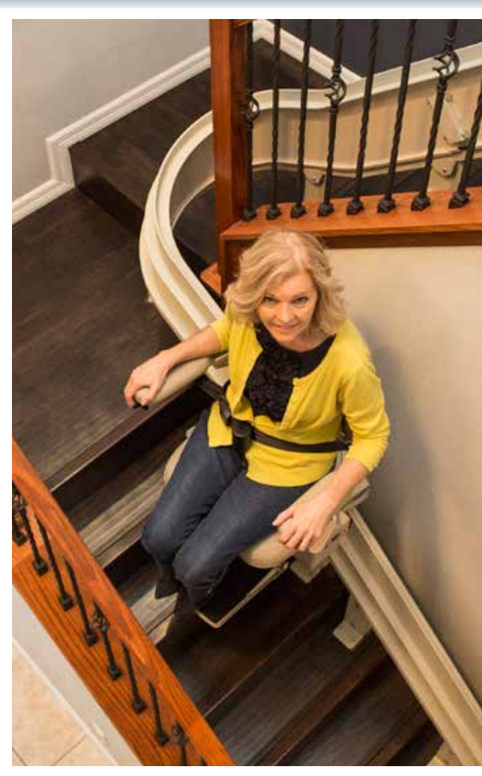
Crafted for a precision fit around curves.

"Exactly what I needed to make the house accessible for me. Excellent install and instructions/demonstration. Very neat and polite and professional." Gerald D.