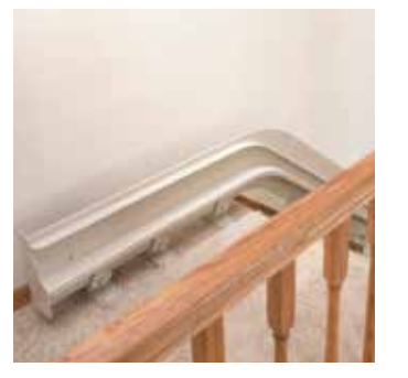
Top or bottom park position extends rail away from the staircase.

• Multiple colors and fabrics • Wider seat • Wider footrest